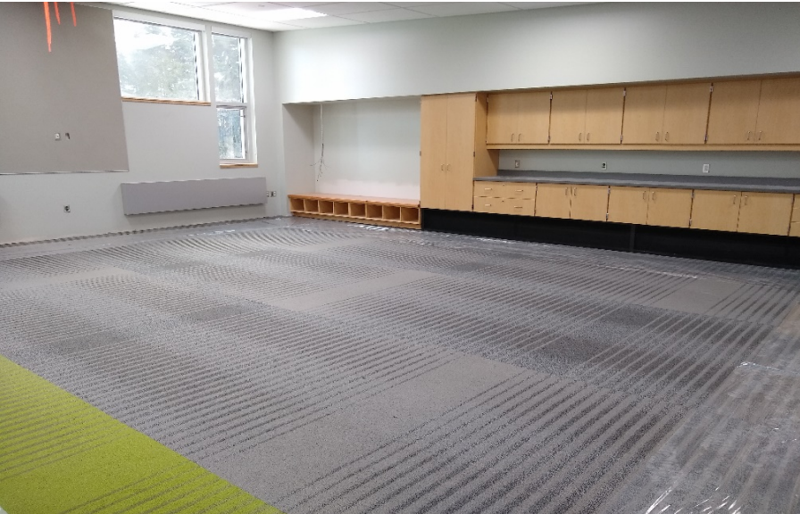
Classroom carpet installation.