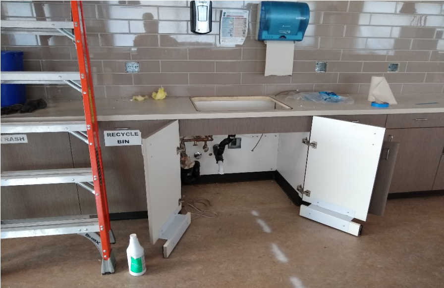
Interior plumbing installation.