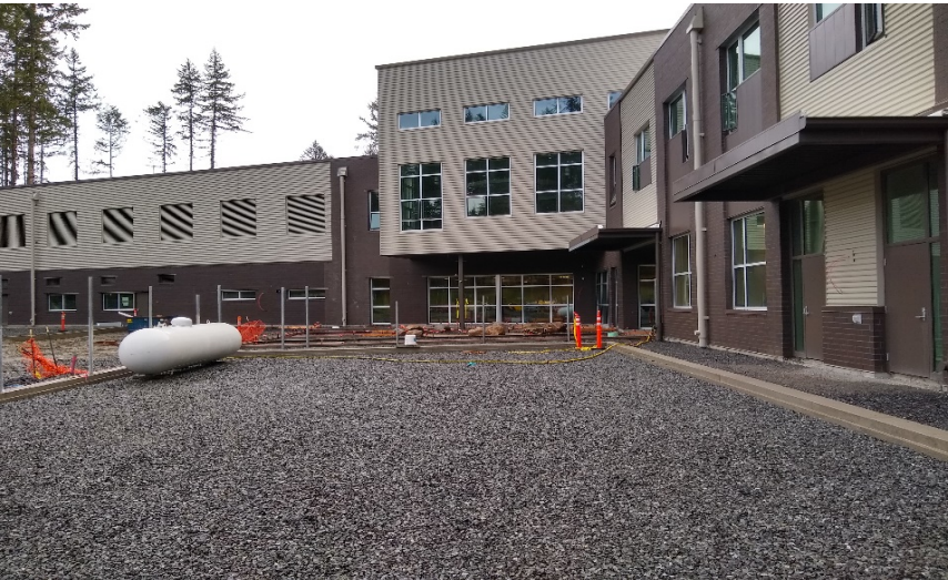
Playground area construction.